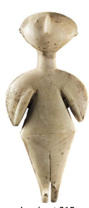
App'x at 215